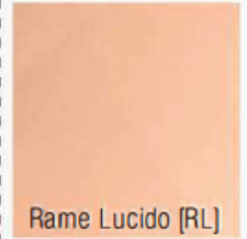
Rame Lucido [RL]