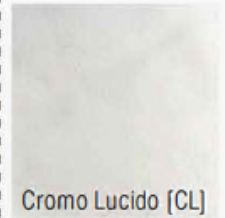
Cromo Lucido [CL]