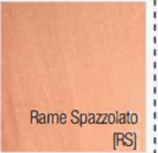
Rame Spazzolato [RS]