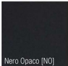
Nero Opaco [NO]