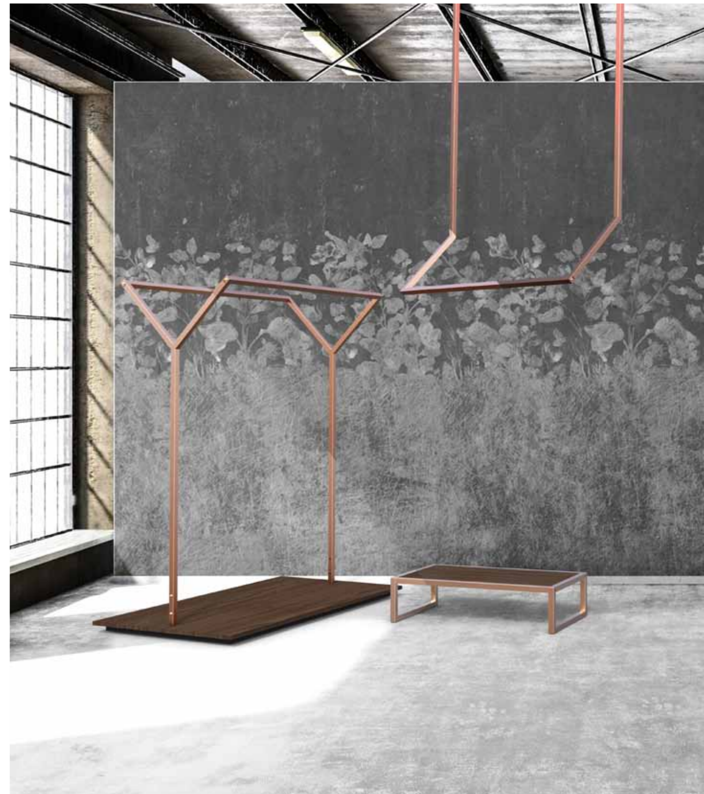
Elementi metallici in rame lucido / base stender e top pedana in nobilitato noce bruno Metal parts in glossy copper / rail base and podium top in brown walnut chipboard