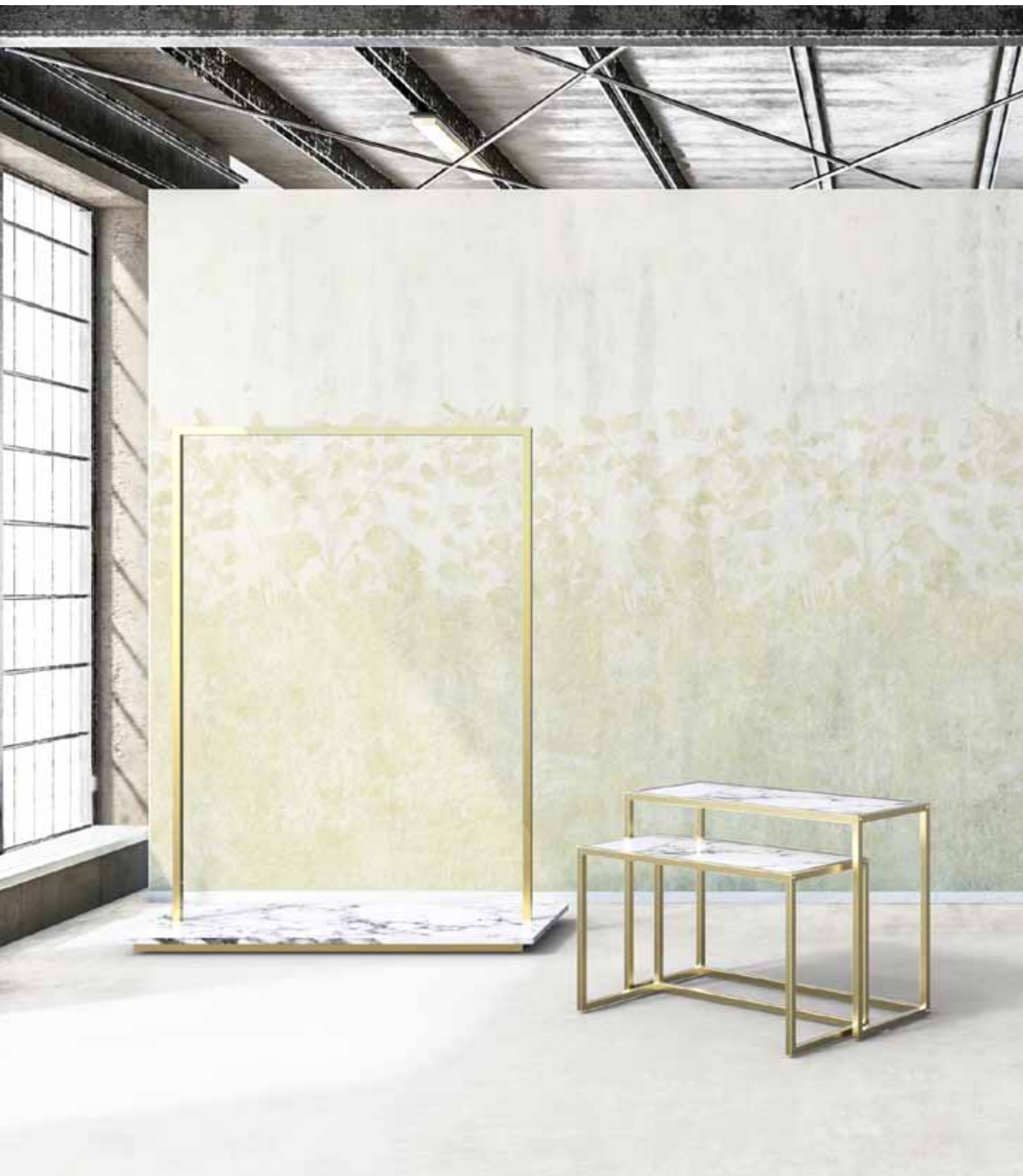
Elementi metallici in ottone lucido / base stender e top tavoli in nobilitato marmo chiaro Metal parts in glossy brass / rail base and table's top in white marble effect chipboard