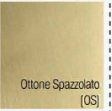
Ottone Spazzolato [OS]