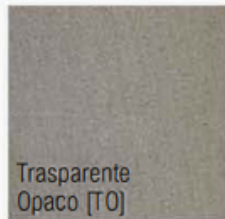
Trasparente Opaco [TO]