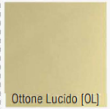
Ottone Lucido [OL]