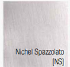
Nichel Spazzolato [NS]