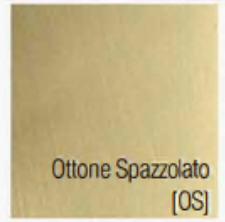
Ottone Spazzolato [OS]