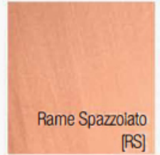
Rame Spazzolato [RS]