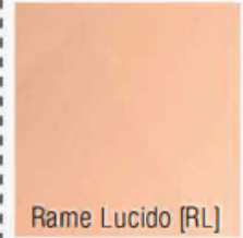
Rame Lucido [RL]