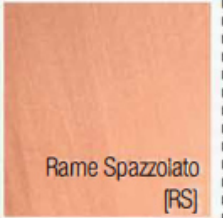
Rame Spazzolato [RS]