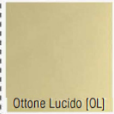
Ottone Lucido [OL]