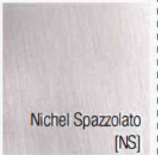
Nichel Spazzolato [NS]