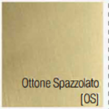
Ottone Spazzolato [OS]