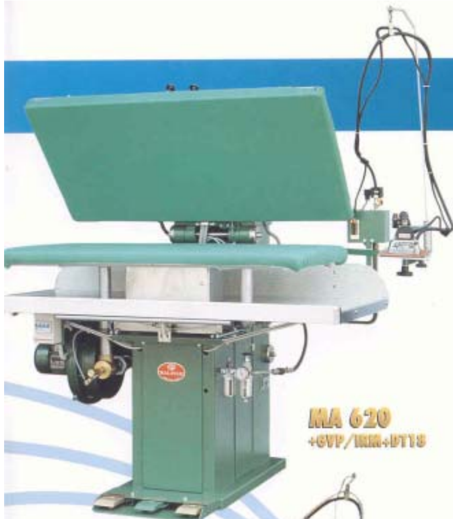
MA 620 +GVP/IRM+DT18