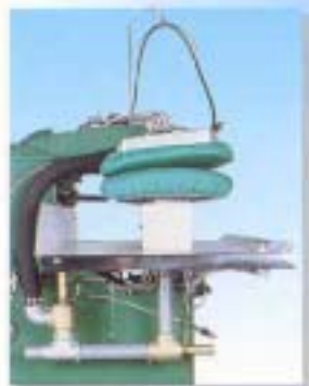
SISTEMA FLAPPING NAPOZZAZIONE SENZA PRESSIONE FLAPPING SYSTEM STEERING HEAD WITHOUT ANY PRESSURE