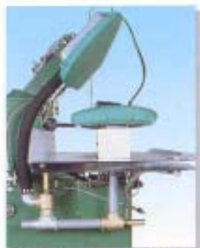
ASPIRAZIONE SUPERIORE ED INFERIORE SUCTIONING HEAD AND NECK