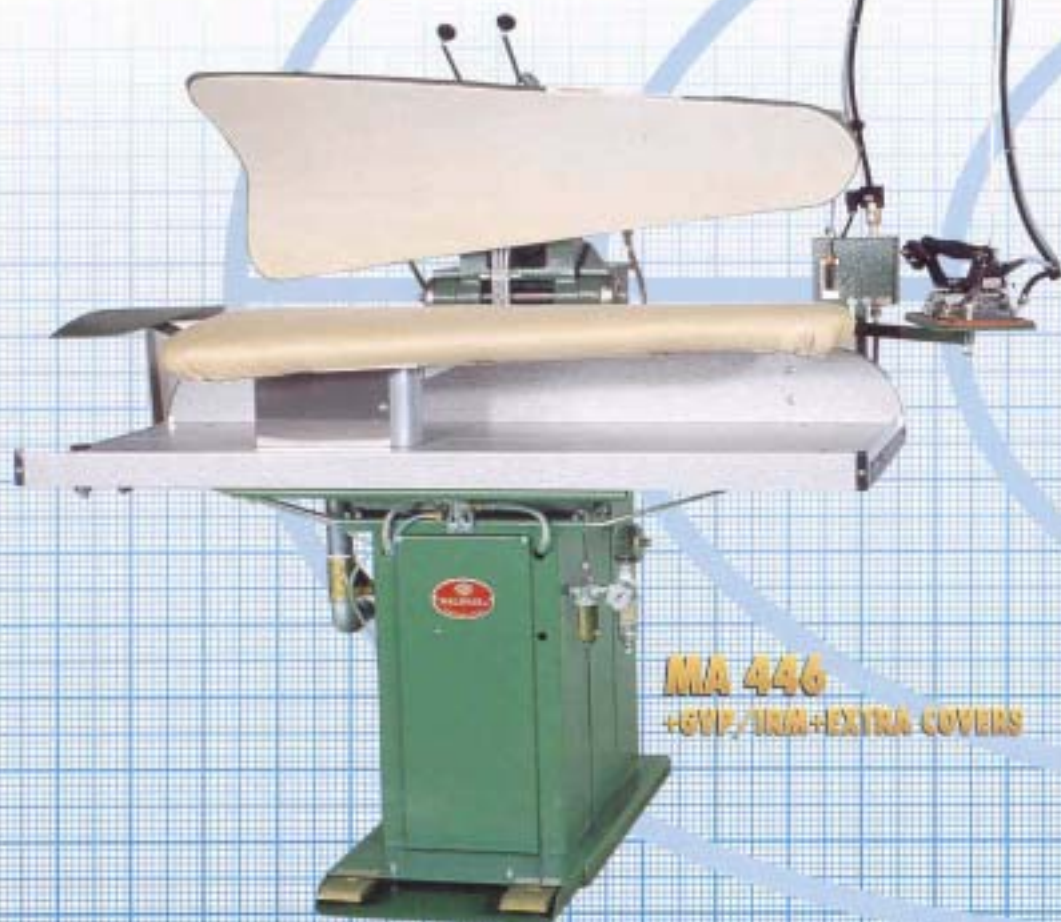
MA 446 +GVP/1000+EXTRA COVERS