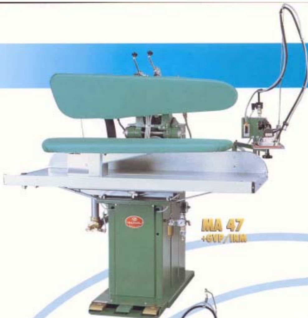
MA 47 +GVP/1000